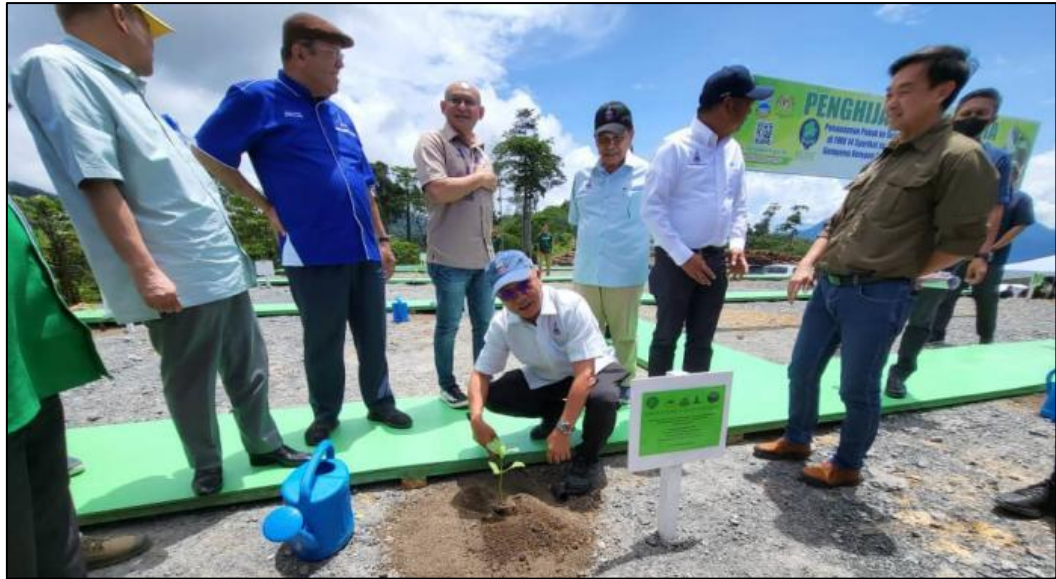
YAB Chief Minister planted Laran seedling in Jawala Plantation Industries SB