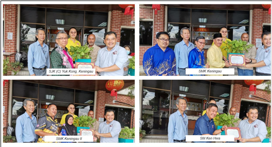
Handover of Laran Seedling to SMK Keningau, SMK Keningau II, Ken Hwa & SJK (C) Yuk Kong.