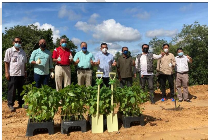
STIA Committees with Ji Her Charity Society and Kota Kinabalu Forest District Officers