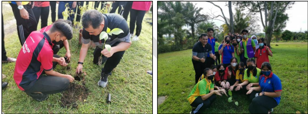
Tree Planting at SMK Apin-Apin