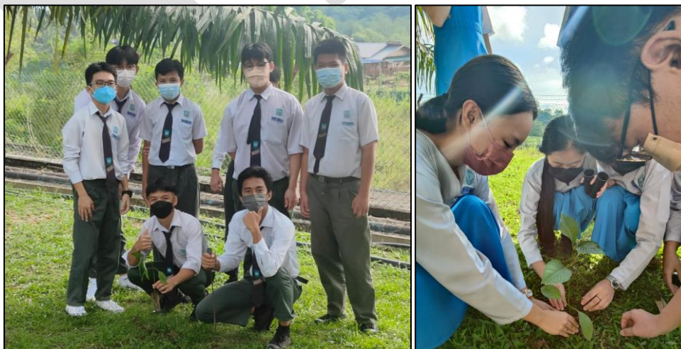
Tree Planting at SM Ken Hwa