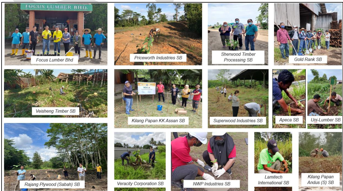
Participating members (virtually via zoom)