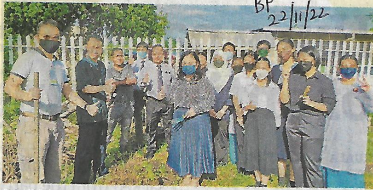
SM All Saints teachers and students after planting a 'laran' tree.